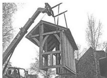
▼ The arrival of the new bus shelter, with John Hughes providing the lifting

When new budgets are available from April, Warwickshire County Council has agreed to fit granite kerbs and to lay a new pavement to the bus stop up Pit Hill, from the oak tree, with universal access.