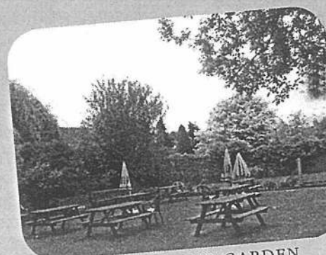
RELAX IN OUR GARDEN

Home cooked food, fine beers & wines, and the beautiful countryside